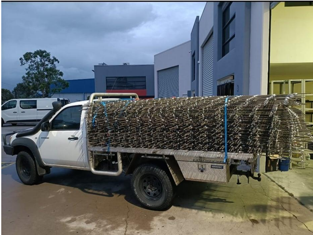
GFRP bars for concrete slabs

The concrete slab at Toowoomba Mosque will be made from Glass Fibre Reinforced Polymer (GFRP) bars, which are corrosion resistant, durable, lighter, more sustainable and stronger than traditional steel bars. Research has shown that GFRP reinforced structures emit 43% less carbon-dioxide than steel reinforced structures and reduce energy consumption by almost 50%. Dr Omar Alajarmeh partnered with private industry to source this at the same cost as steel. This initiative is a crucial step toward achieving the Australian Government's 2050 plan for net zero emissions.